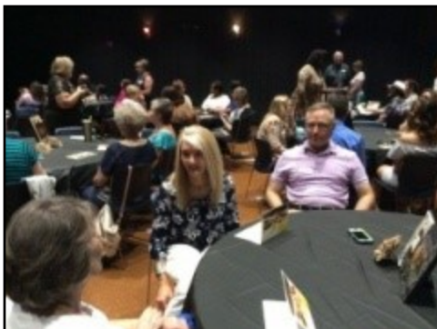
Volunteers gathered and enjoying some fellowship time