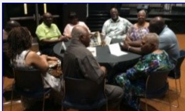
This group from First Baptist Church, Garman Street received an award for having the most volunteers present at the Brunch.

Visit our website to see many more photos from the Volunteer Appreciation Brunch.