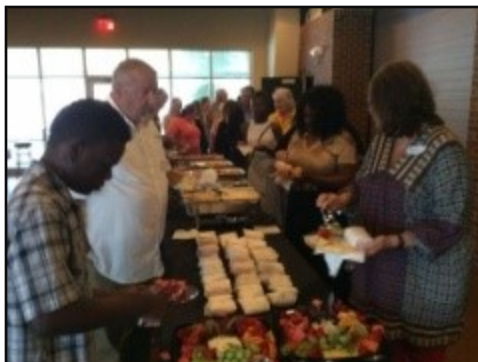
Going through the Brunch line