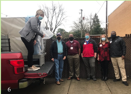
Photos 4-8: Members of the Houston Medical Center IT Department graciously provided gifts and helped deliver a donated bed and mattress.