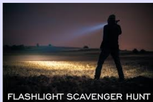
FLASHLIGHT SCAVENGER HUNT