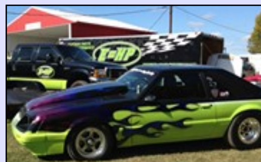
See the "Performance Racing" Car