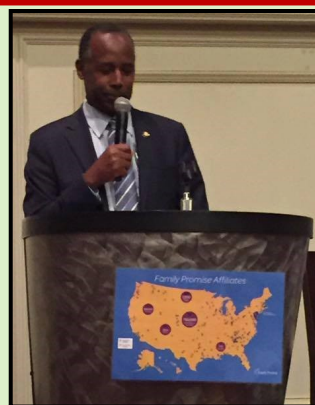
Dr. Ben Carson