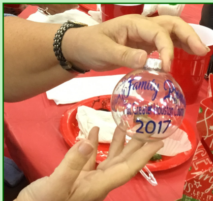
Each attendee received a handcrafted ornament created by a former guest