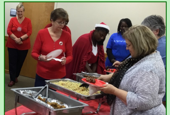
Delicious food enjoyed by all