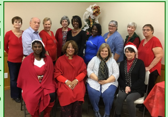
Thanking an Awesome Group of Coordinators

This year we started a new tradition with our first annual Christmas party for our Family Promise Coordinators. This fantastic group of 35 men and women work tirelessly to make sure our families have all their needs met each week. Although our guests are at a host church for one week, coordinators put in 3-4 weeks of planning prior to hosting and most of our coordinators are so dedicated they also take on roles outside of their host week. You may see them driving the van, filling in at other churches when needed, fundraising, recruiting and training volunteers, and so much more. This was just one small way for us to show our appreciation for all they do. Thank you, so much, for being Elves year round! Merry Christmas to you all and we look forward to working with you in 2018!