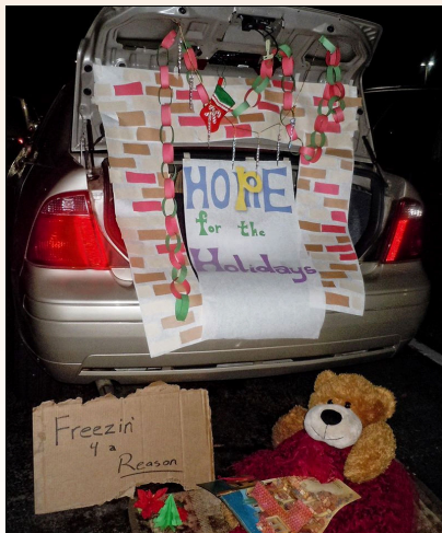
A decorated car from the 2014 Car City Event. We expect warmer weather this year!

Two NEW ACTIVITIES this year – a Vehicle Decorating Contest and a Flashlight Scavenger Hunt. You may bring your vehicle/trunk decorated or use the materials we will have on hand. Judging will conclude by 8:45 PM. Following the Movie a Scavenger Hunt will commence searching for items on vehicles in the Car City Parking Lot Spaces. We hope you will want to spend the night and glean a few insights about homelessness from spending the night in your car....however, if that is not possible, come out and join in the events of the evening and offer your support for the children and families served in the Family Promise program.