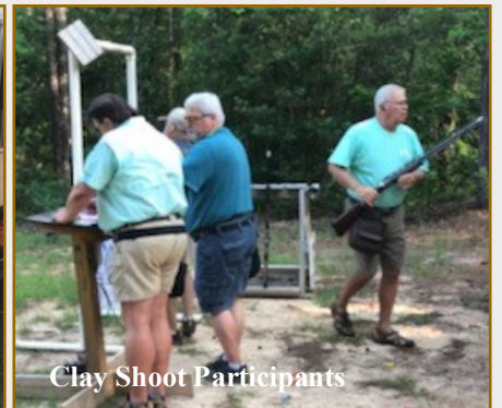
Clay Shoot Participants

Thank You to Everyone who was a part of the Planning, Execution, Support, and Participation of this Event! We appreciate your dedication in supporting Family Promise of Greater Houston County.