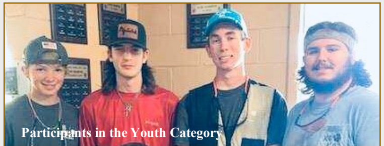
Participants in the Youth Category