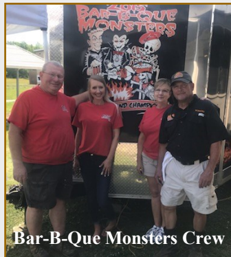
Bar-B-Que Monsters Crew